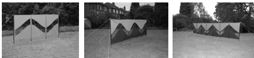
Windbreaks 4, 6 & 8 should be guyed out as shown

Start at one end. It will help if a second person present holds the pole upright, whilst you attach two guy ropes to the pole spike and peg out. Repeat this for the pole on the opposite end and then guy and peg all the intermediate poles.